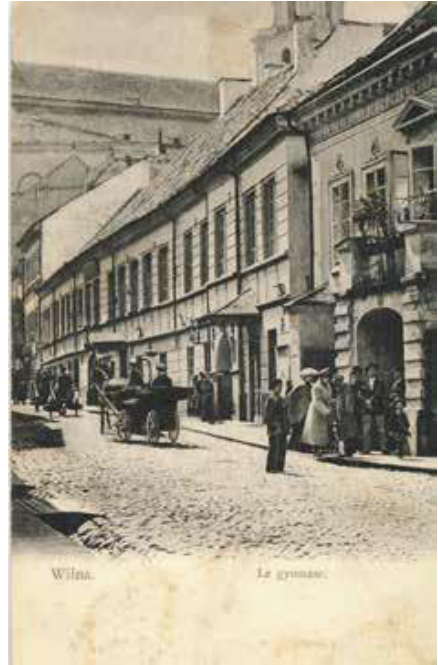
Fig. 2. Entrance to the Vilnius Drawing School from Pilies Street. Postcard

The first three years of study were open to all applicants, but the “special” course taught during the fourth year could be accessed only upon completing the initial courses or passing an examination. Judging from the fact that, having arrived in Vilnius in the summer of 1909, Soutine took this exam, he must have enrolled in the “special” course.