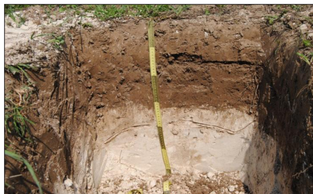
Fig. 2. Rendzinas developed from chalk, Volynian Polisia region

It has been stated that the largest overall areas of rendzinas extension are concentrated in Turiys'k-Rorzhyshchens'k natural area, Volynian Polisia region, Polisia territory, or within such administrative districts as: Turiys'k, Lyuboml', Kovel', Volodymyr-Volyns'k, Ivanychykivs'k, less – in Horohiv and Rorshyshche. Rendzinas are mostly allocated on the elevated relief elements, where quaternary deposits covering eluvium-diluvium chalks are washed out. The given soils are found as separate lots among podzolic soils (Figs. 1 and 2).