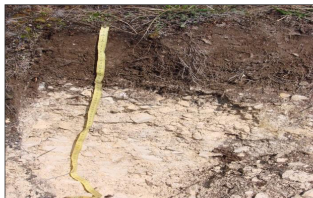
Fig. 4. Rendzinas developed from marly opoka, Western Podolia region

In Ternopil' (Zboriv, Pochaiv, Kremenets districts), Khmelnyts'k (Volochnys'k, Horodok, Dunav districts) and in Chernivtsi (Zastavna and Sokyrany districts) regions rendzinas areas make 27, 36 and 83 km 2 or 2.6, 3.5 and 8.2% of all region rendzinas area, correspondingly. A distinctive feature of rendzinas massive areas in Ternopil' region is that they are close to limestone hills of Malyi Polisia, where less thickness is washed off and the products of limestone and cretaceous marl weathering, which become soil parent rocks, appear on the surface (Table, Figs. 1, 4).