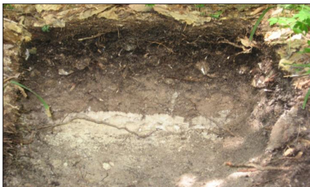
Fig. 5. Rendzinas developed from Upper Baden limestone of Rostochchya region

The characteristic feature of continuous rendzinas areas in Chernivtsi region is that they are disposed in a narrow stripe form along the Dniester valley, on steep slopes of different exposition (Fig. 1).