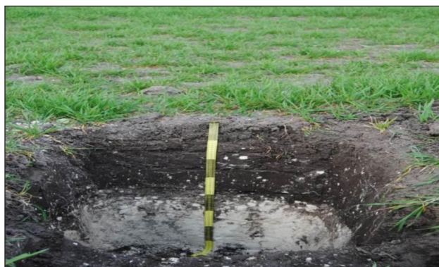
Fig. 3. Rendzinas developed from cretaceous marl, Malyi Polisia region

According to administrative division, rendzinas in Lviv region are concentrated in Radekhiv,