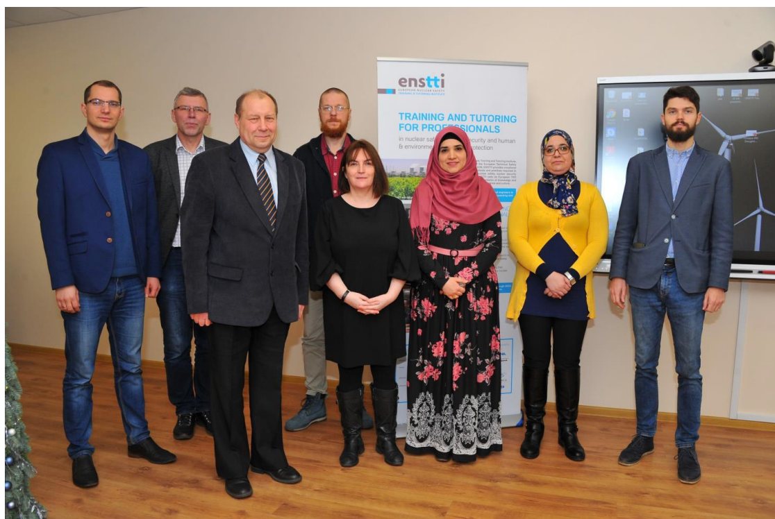
Group picture of the Tutoring Evaluation Workshop participants

At the end of the internship, the trainees prepared reports in which they demonstrated the gained knowledge and the individual work done during the tutoring. The reports were addressed to the IAEA and ENSTTI authorities. The gained knowledge and individual activities