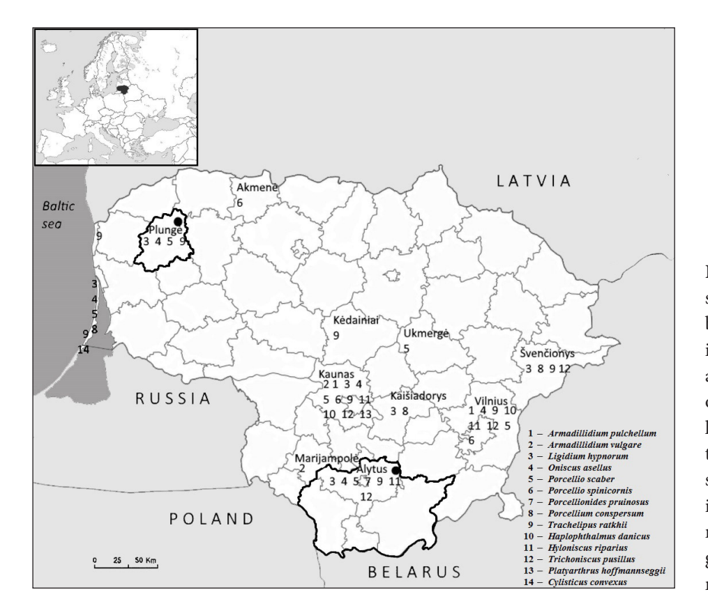
Fig. 1. Map of the sampling and distribution of terrestrial isopods in Lithuania. Data are based on the records in the literature from 2012 to 2017 and the present study (districts in the southern and north-western regions Lithuania are marked by bold line)

Lithuania's climate is humid, with moderating effects from the Baltic Sea. January is the coldest month with daytime temperatures usually around -5°C and July is the warmest month with an average temperature of 18°C. The average annual precipitation is 661 mm (Lithuanian Hydrometeorological Service under the Ministry of Environment). Compared to the other localities of Lithuania, more pronounced contrasts of seasonal temperature are characteristic of the southern region. In spring and summer, the average monthly air temperature here is 1.0°C higher than in the western or northern regions of the country. Higher fluctuations of daily temperatures typical in the southern part of the country. These variations are affected by sandy areas, which are warm easily (in summer, sand surfaces can heat up to 50°C) and quickly deliver the accumulated heat (Natural Heritage Foundation 2014). A survey of isopods was conducted in Alytus district (54°23'46"N 24°2'29"E) in the southern part of Lithuania (Fig. 1).