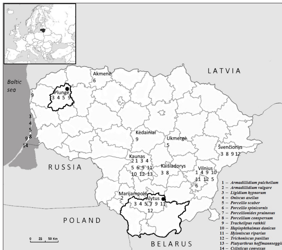
Fig. 1. Map of the sampling and distribution of terrestrial isopods in Lithuania. Data are based on the records in the literature from 2012 to 2017 and the present study (districts in the southern and north-western regions Lithuania are marked by bold line)

Lithuania's climate is humid, with moderating effects from the Baltic Sea. January is the coldest month with daytime temperatures usually around -5^{\circ}\text{C} and July is the warmest month with an average temperature of 18^{\circ}\text{C} . The average annual precipitation is 661 mm (Lithuanian Hydrometeorological Service under the Ministry of Environment). Compared to the other localities of Lithuania, more pronounced contrasts of seasonal temperature are characteristic of the southern region. In spring and summer, the average monthly air temperature here is 1.0^{\circ}\text{C} higher than in the western or northern regions of the country. Higher fluctuations of daily temperatures typical in the southern part of the country. These variations are affected by sandy areas, which are warm easily (in summer, sand surfaces can heat up to 50^{\circ}\text{C} ) and quickly deliver the accumulated heat (Natural Heritage Foundation 2014). A survey of isopods was conducted in Alytus district ( 54^{\circ}23'46''\text{N} 24^{\circ}2'29''\text{E} ) in the southern part of Lithuania (Fig. 1).