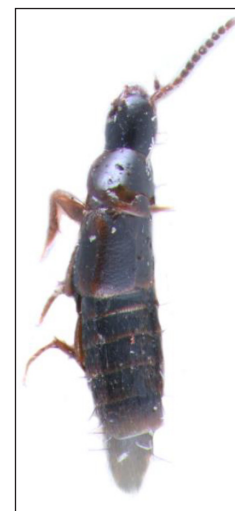
Fig. 3. Heterothops dissimilis