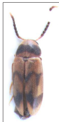
Fig. 4. Abdera flexuosa

Kulionys env., 16.06.2014, 1 spec., in a sweep net (det. R. F.). One record (Ferenca et al., 2002).