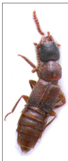
Fig. 2. Medon apicalis

Branišavos Miškas f., 03–19.07.2015, 2 spec., reared from trunks of deciduous trees. One report (Ferenca & Tamutis, 2009).